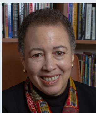
Beverly Daniel Tatum

Throughout her career, and as president emerita of Spelman College, Dr. Beverly Daniel Tatum has exemplified inclusive leadership with deep expertise in race relations and respected experience in higher education administration. Her books, Why Are All the Black Kids Sitting Together in the Cafeteria? and Other Conversations About Race (2017) and Can We Talk About Race? and Other Conversations in an Era of School Resegregation (2007), and accomplishments, including the Brock International Prize in Education and American Psychological Association Award for Outstanding Lifetime Contributions to Psychology, make her a highly sought-after speaker.